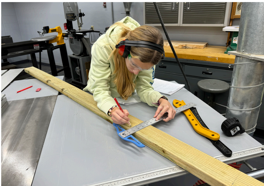
9th-grade students in their Intro to Fab and Making Class measure boards for their Farmhouse bench project.