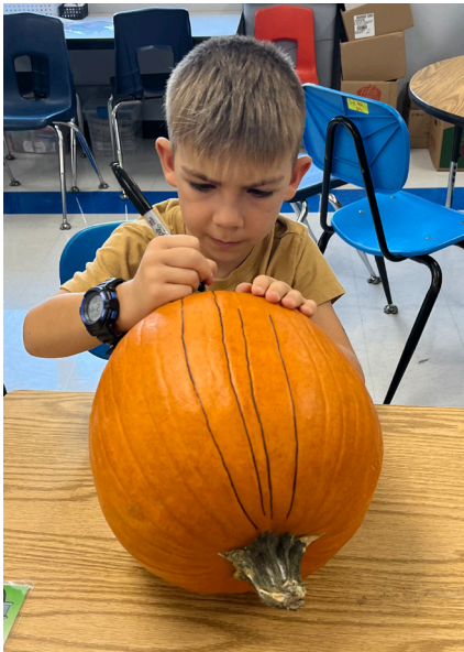
This 3rd-grade student is learning Latitude and Longitude with a Sharpie and a pumpkin.