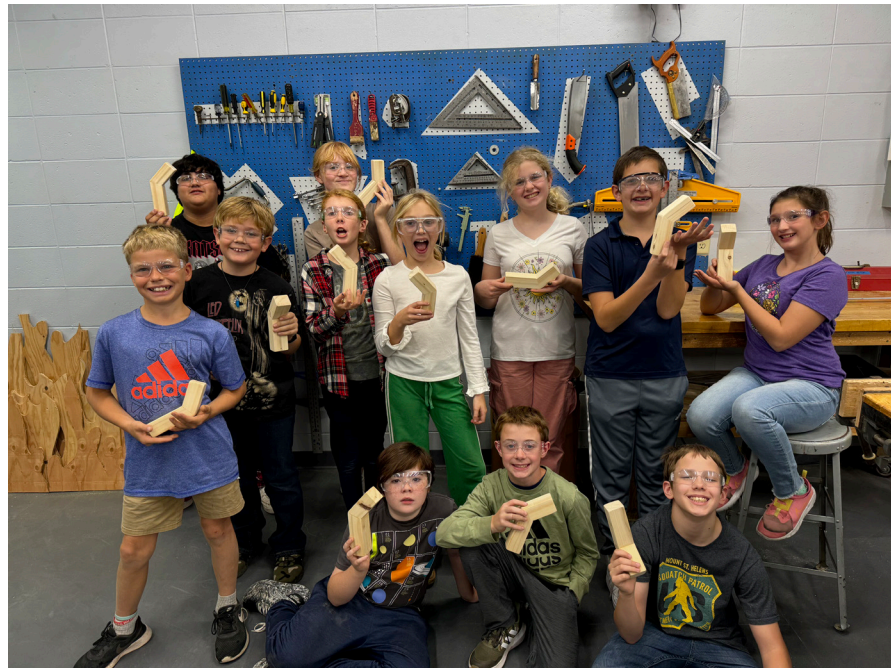
The 5th and 6th graders completed The Cedar Hook project designed to help students practice drilling skills.