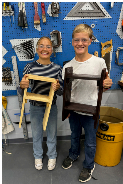
Returning middle school students to the shop apply cutting and fastening techniques as they build a shelf for their locker at school.