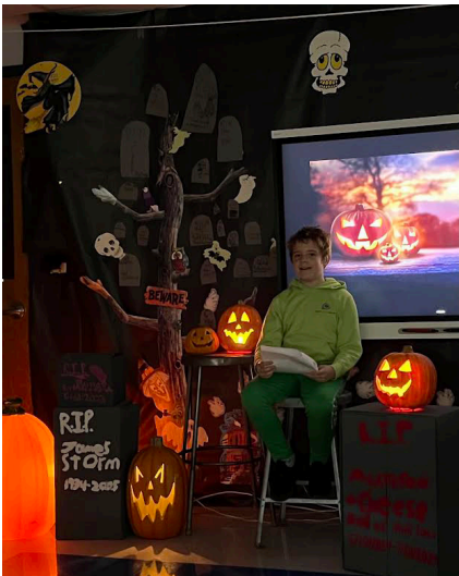
On Halloween, the 3rd and 4th grade students invited their families, friends, and other students to come and listen to them tell their scary stories just by the light of jack-o-lanterns.