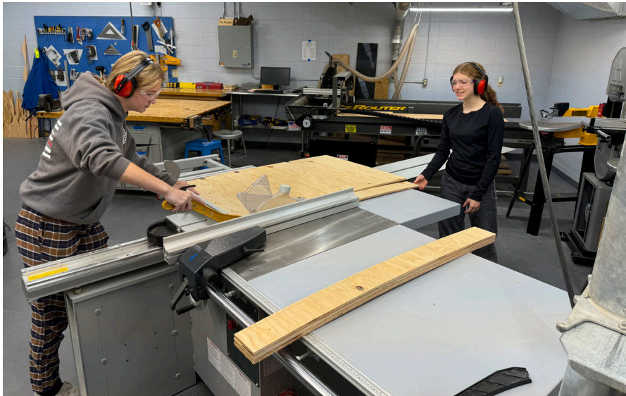
The 10th grade Fab and Making Class is working on new scoreboards for next season's Island soccer games.