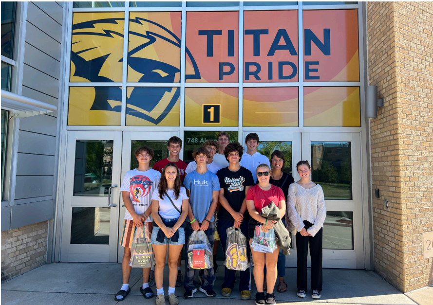
This fall, juniors and seniors had the opportunity to attend the Wisconsin Education Fair at UW-Oshkosh, where they explored over 100 colleges, universities, and military branches to help refine their college search. After the fair, students toured the campus and enjoyed lunch at Blackhawk Commons.