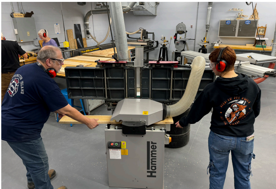
For 6 weeks this past September and October, 9 participants attended WISD's adult woodshop class. They brushed up on techniques and learned to use new machines. All while working towards a final project. Pictured here is a couple jointing and planing boards.